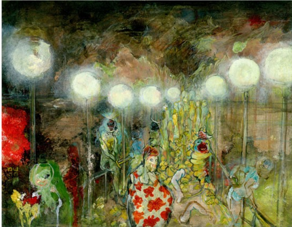
Myrtle Van Damitz III, Night Walk , 2011. Inks and acrylic on paper. Courtesy of the artist.

In 1979, Bookhardt published the first edition of Geopsychic Wonders , an illustrated book celebrating the Crescent City's idiosyncratic urban landscape. The book sparked a cult following among generations of New Orleans artists. Sharing startling similarities with the situationists' psychogeography, whose key words it inverts, geopsychics is a tribute to New Orleans's fertile anarcho-situationist soil.