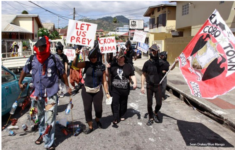
Cat in Bag Productions, Cobo Town , 2010.

In Trinidad and Tobago, which has a longstanding history of rebellion at Carnival time, beaded bikinis made in China sell for up to $2,500 each, turning exotic bodies into tourist commodities. The “ole mas” tradition, which, much like the Occupy movement, included cardboard placards adorned with political slogans, once offered a healthy public forum for political commentary, but is now largely extinct (challenging one occupier’s belief that “My Cardboard Can Beat Your Billboard”). Only a small enclave of artists keeps the ole mas tradition alive. In the mid-1980s, Peter Minshall’s Rat Race mas band took Port of Spain by storm with its army of masqueraders dressed as rodents holding speech bubbles admonishing greed, gossip, and gullibility in the local vernacular. 19 In a DIY style similar to the vanishing Carnival tradition as it could still be observed in 2005, artists Ashraph Richard Ramsaran and Shalini Seereeram created T’in Cow Fat Cow (2009) and Cobo Town (2010). 20 These pieces consisted of hand-lettered placards and flags bearing puns about government corruption and public complicity, such as “The People Must be Herd” and “Let us Prey.” 21