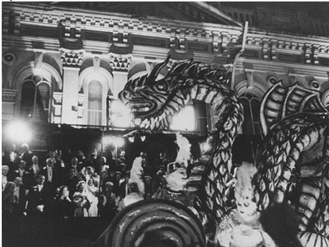
Dragon Float in the Mistick Krewe of Comus parade on Mardi Gras evening, New Orleans, circa 1970s from the book Geopsychic Wonders of New