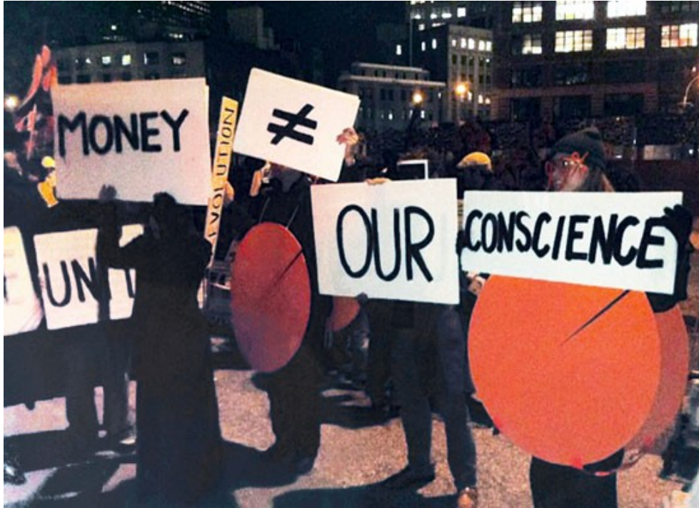
Build the Occupation, Occupy Halloween: The Language Experiment , New York, October 31, 2011.

Martinez's Whitney Biennial piece "I can't ever imagine wanting to be white" (1993). 7 Taken together, the performers formed living sentences, the written equivalent of the "human microphone," the occupiers' signature voice amplification technique. These occupation builders delivered collective messages that were permutable at will, if within the range of a carefully chosen consciousness-raising vocabulary.