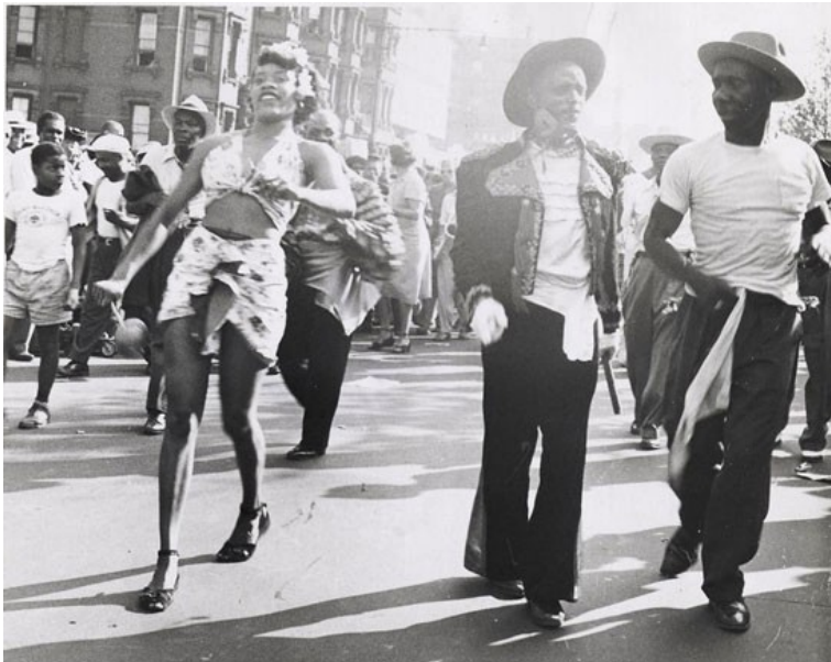
West Indian Day Parade, Harlem, September 6, 1948. Photographic print.

carnavalesque goals.” This leaves much to be desired in terms of what a greater understanding of the carnival tradition could bring to the movement. (Admittedly, Tate was probably not referring to Carnival at all, as is often the case when using the word “carnavalesque.”) Ironically, Tate’s writing style displays its own carnivalesque sensibility. In a sort of noir grotesque realism, Tate resorts to a raced Rabelaisian semantic field through the use of reappropriated racial slurs like “Negroes,” “Niggas,” “Niggerization,” and “Niggerdom.” He also uses racy expressions such as “bootylicious,” “muhfuhkuhs,” “shit,” “asswhuppings,” “grownass,” and “clusterfuck.” These expressions are made up of words—booty, fuck, shit, ass—that exemplify what Bakhtin called the “material bodily lower stratum.” But Tate can hardly be blamed for missing the carnival point even as he uses carnivalesque language, since in the US this language is more closely associated with America’s own brand of racial carnivalesque, from minstrelsy to blaxpotation and hip hop. (It is worth noting that American minstrelsy shaped an actual carnival in the early twentieth century, namely, the Cape Town Carnival in South Africa, which was formerly known as the Coon Carnival.)