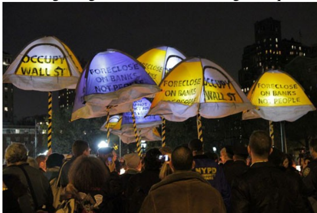
Mili-tents , New York (Washington Square Park to Duarte Park march), November 20, 2011. See → .

The march was organized by the interfaith clergy group Occupy Faith NYC, the Council of Elders, and various OWS-affiliated arts and culture groups such as Not an Alternative. 33 In addition to candles, marchers carried so-called mili-tents to symbolize occupation, and their destination prefigured a possible future occupation. Despite the military language of deployment and invasion the artists-activists used when discussing the dissemination of the mili-tents, these and other artistic interventions that surfaced on N17—such as the black-and-yellow banners and placards (the latter doubling up as shields)—were not meant to encourage confrontation with the police. On the contrary, their purpose was to divert attention away from the overwhelming media focus on clashes between occupiers and the NYPD. These interventions, more recently carried out with tape, sought to dislocate the power of authority over space by appropriating and