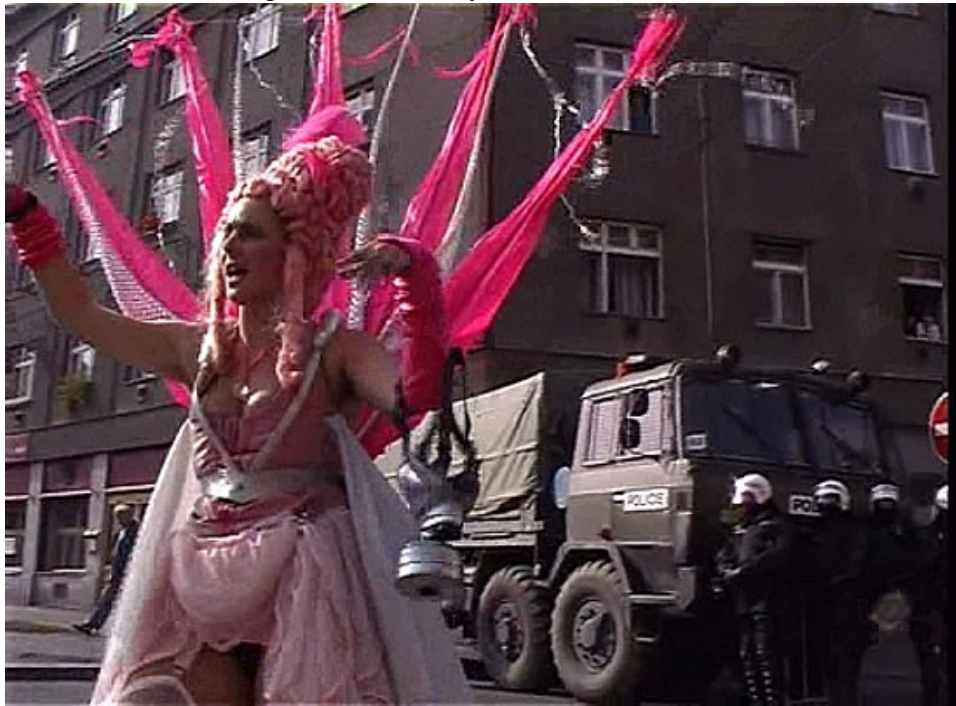
Marcelo Expósito, Radical Imagination (Carnivals of Resistance) , 2004. Video still. The film documents J18.

Russia until 1965 due to its veiled critique of Stalin's purges. The American and French publications of the book (in 1968 and 1970, respectively) gave European and North American anarchists an anti-hierarchical societal model that appealed to their revolutionary aspirations. But it was French situationist Raoul Vaneigem, in his book The Revolution of Everyday Life (1967) 9 , who fueled the May 1968 student movement with what could be called Carnival liberation theory. Presciently, Vaneigem wrote that "a strike for higher wages or a rowdy demonstration can awaken the carnival spirit," and "revolutionary moments are carnivals in which the individual life celebrates its unification with a regenerated society."