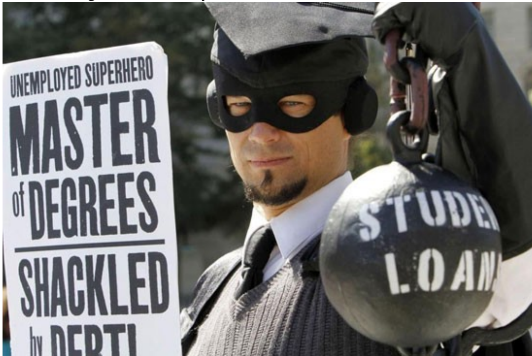
"Unemployed Superhero, Master of Degrees, Shackled with Debts", Occupy Wall Street, New York, October 2011.

Then there were the countless examples of personal ingenuity. In the early days of the movement, a helmeted woman in fur boots and a figure skating outfit was seen riding a gold and pink papier mâché unicorn. In another case, a young man dressed up as what might be called a Zorro Graduate. He wore the black mask and gloves of the TV avenger, along with a black graduation hat and gown. He held a convict's chain and iron ball printed with the words "student loan" and a sign reading "Unemployed Superhero, Master of Degrees, Shackled by Debt."