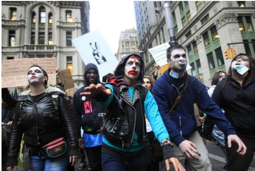
Corporate Zombies walk, Occupy Wall Street, New York, October 3, 2011.

and these contemporary carnivals have retained their rebellious potential. The encampment at Liberty Plaza, as Occupiers re-christened Zuccotti Park, was under Carnival's sway—until cold weather set in and the camp was raided by police on November 15. In the early days of the movement, primal energies gave way to intentional community-building and free communal feeding, bodies at play and trash on display, excess and refuse. Raised eyebrows about alleged sexual acts in the park and confessions of gluttony for the famous OccuPie pizza were all instances of the pleasures of the senses and excesses of the flesh that are common to Carnival—even under the duress of uncomfortable accommodations and police harassment.