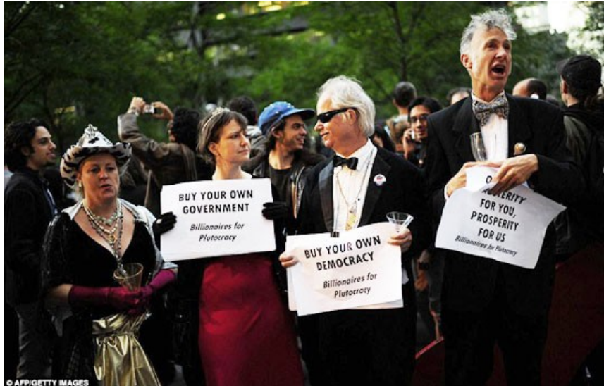
Millionaires March, Occupy Wall Street, New York, October 11, 2011.

Then there were the countless examples of personal ingenuity. In the early days of the movement, a helmeted woman in fur boots and a figure skating outfit was seen riding a gold and pink papier mâché unicorn. In another case, a young man dressed up as what might be called a Zorro Graduate. He wore the black mask and gloves of the TV avenger, along with a black graduation hat and gown. He held a convict's chain and iron ball printed with the words "student loan" and a sign reading "Unemployed Superhero, Master of Degrees, Shackled by Debt."