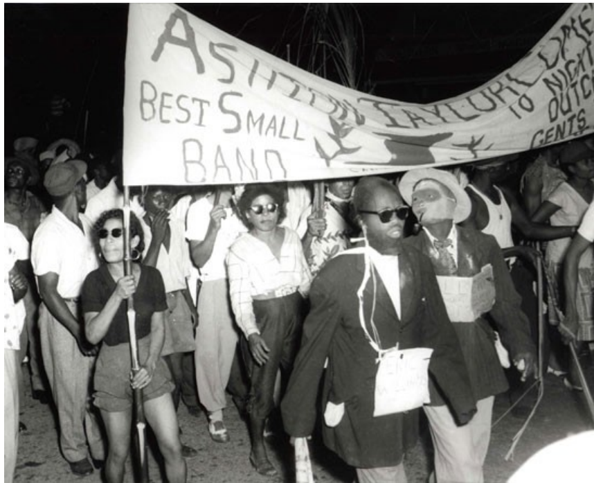
Portrayal of Dr. Eric Williams at Carnival in Trinidad after the first PNM (People's National Movement) victory at the polls in 1956.