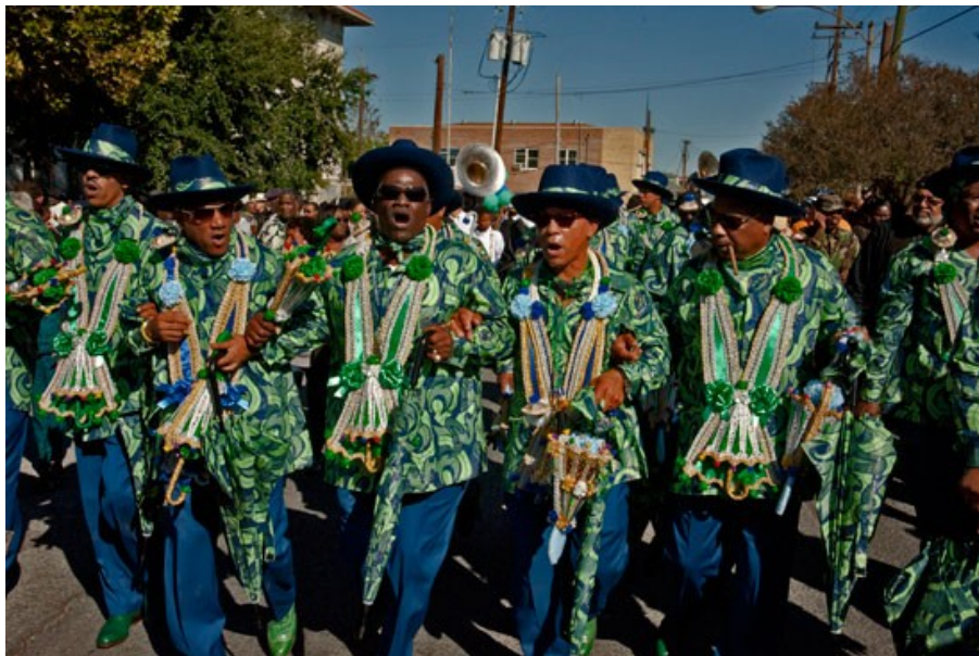
Black Men of Labor Social Aid & Pleasure Club Second Line, New Orleans, October 29, 2011.

In New Orleans, Mardi Gras remains an exercise in subtle segregation. The fact that there are not floats to give Occupy New Orleans any traction might confirm, as in Trinidad, the safety valve theory of Carnival. Occupy New Orleans officially started on