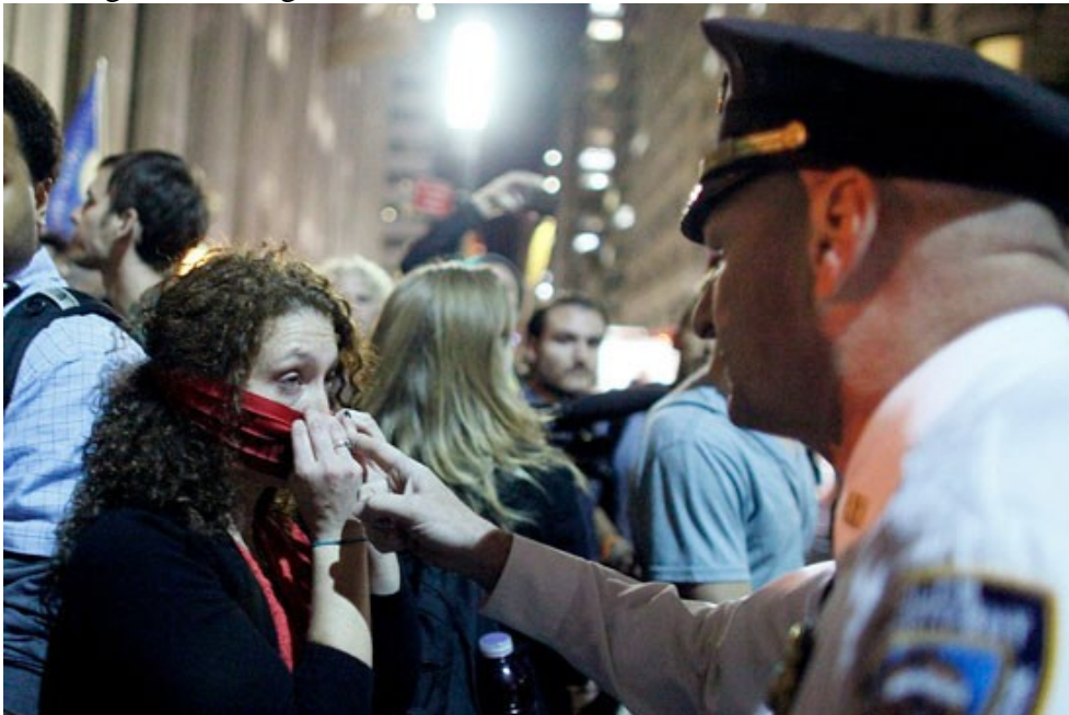
Woman wearing scarf with police officer, Occupy Wall Street, October 5, 2011.

While some commentators and journalists have dismissed Occupy Wall Street as carnival, lawmakers and police officers did not miss the point. They reached back to a mid-nineteenth century ban on masking to arrest occupiers wearing as little as a folded bandana on the forehead, leaving little doubt about their fear of Carnival as a potent form of political protest. New York Times journalist Ginia Bellafante initially expressed skepticism about “air[ing] societal grievance as carnival,” but just a few days later she warned against “criminalizing costume,” thus changing her condescension to caution as she confirmed the police’s point: masking can be dangerous, Carnival is serious business. 1